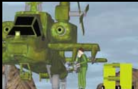
Apache Training Simulator courtesy of Safeworks, Inc.