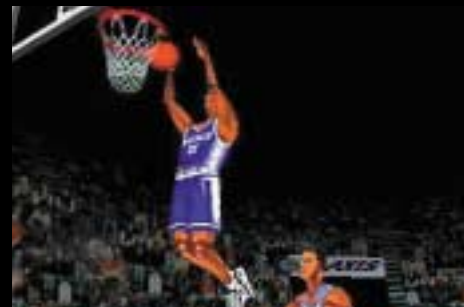
Fox Sports College Hoops for Nintendo 64. courtesy Z-Axis © 1999