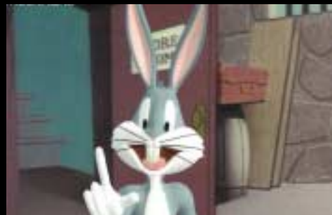
Bugs Bunny © 1999 Warner Brothers/Medialab