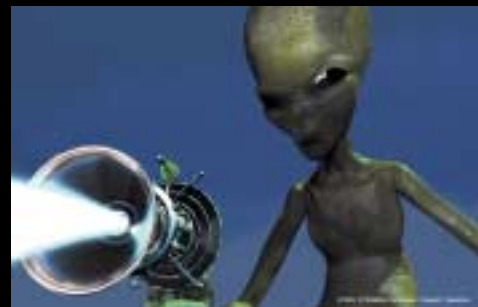
Alaris TV commercial © 1999 Stromboli Animation/Daiquiri/SpainBox