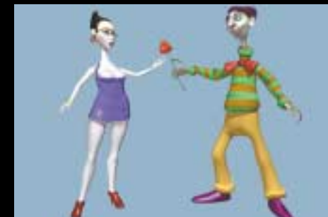
Max and Paloma Real-Time Performance Animation courtesy of DreamTeam