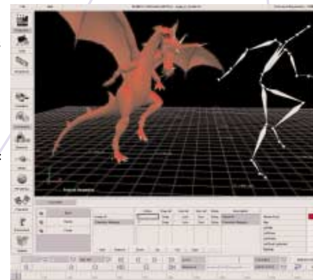
Powerful plug-ins now smoothly integrate motion data into all major software animation programs.

MotionStar. Our original, affordable tracker for live performance animation. MotionStar wraps the best features of Ascension's DC magnetic technology — fast, long range tracking, in all kinds of environments — around your real world requirements. It gives you instant capture of multiple characters, motion previewing, and reliable long-term use.