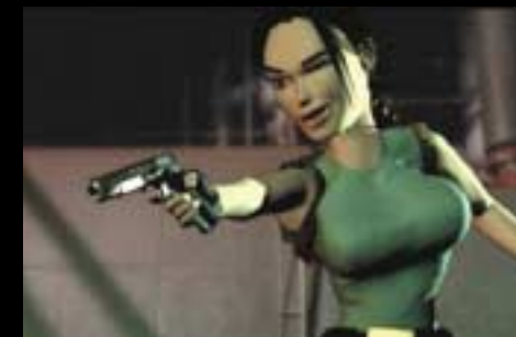
Lara Croft image courtesy of Eidos Interactive/Core Design Ltd./ SZM Studios