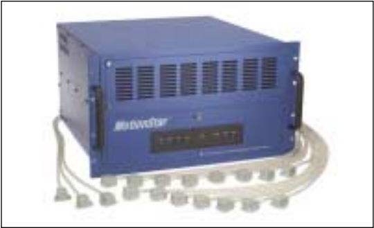
This system also includes the Extended Range Transmitter & Controller.